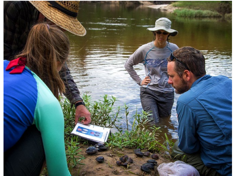
Nature Conservancy staff and interns conducting freshwater mussel surveys of Village Creek.

TNC staff visited sixty-six bird points post-Harvey to assess avian response to the Harvey event. The bird plots did not show a significant decrease in species (7 to 6), and the foraging guilds did not change significantly. A more detailed report is being prepared on the avian and forest monitoring.