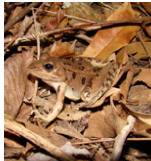
Left: Southern Leopard Frog in the Atchafalaya Basin, Louisiana