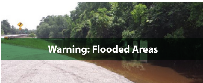
Flooded trail areas

In the coming days and weeks, park staff will begin work to remove fallen trees, repair foot bridges, and restore the preserve trail network to the high standards of safety that we have come to expect. Look for updates on trail conditions on your website at www.nps.gov/bith and our Facebook page at www.facebook.com/BigThicketNPS .