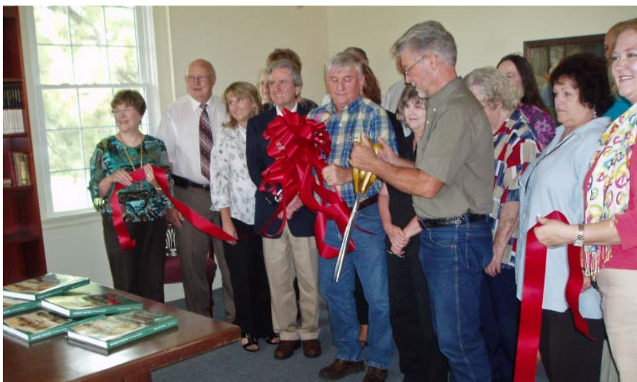
The Hardin County Historical Commission hosted a ribbon-cutting ceremony on June 23 for the opening of a new “home” and proposed museum.