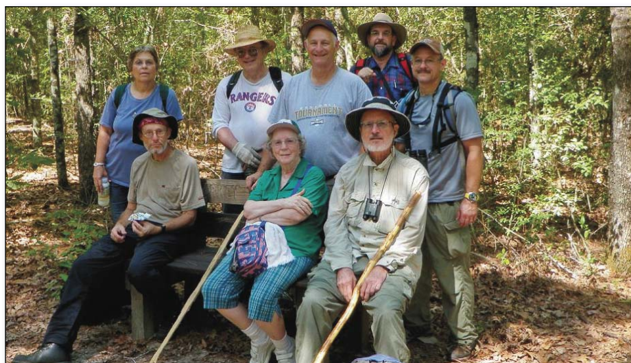
← A few of the 20 people that hiked and participated in "The Longest Day Hike." The hike, held on June 25 — the Saturday following the summer solstice — was sponsored by the Golden Triangle Sierra group. See story on page 6.