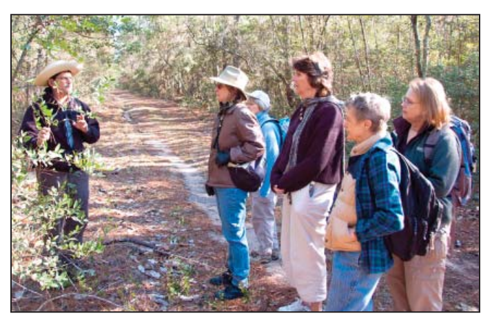
Houston Sierra Forestry Group on Beech Woods Trail